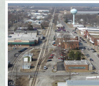
Historic Community - Shopping