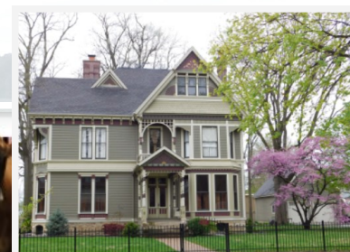
Sisters Inn - Come & Stay!