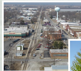
Historic Downtown - Shopping