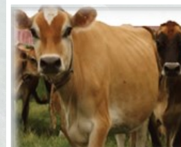
Kilgus Farmstead - The only single source farmstead milk bottling plant in Central Illinois.