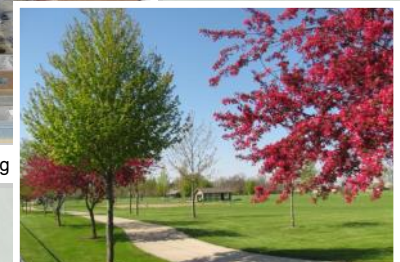
North Park - Walking Trails - 708 N 1st St.