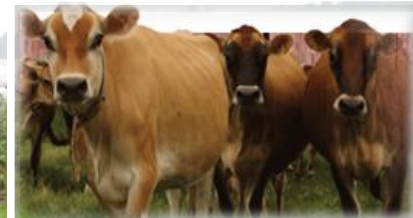
Kilgus Farmstead - The only single source farmstead milk bottling plant in Central Illinois.