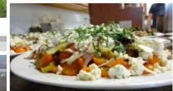
Dinner Farm Tours