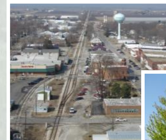
Historic Downtown - Shopping